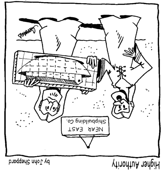
"I understand it holds two animals of every species, but we just don't see a need for it at this time, Noah"